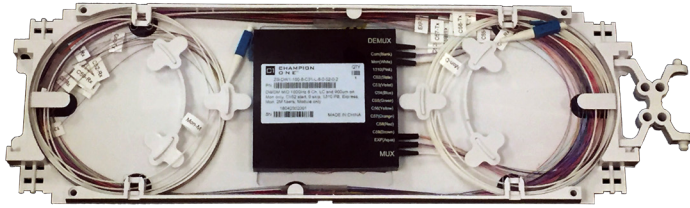
Similar Module in Tyco "B" Tray